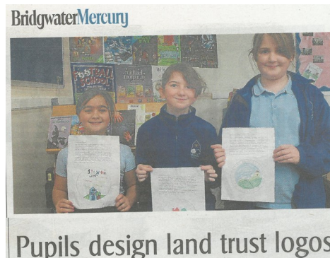
Pupils design land trust logos